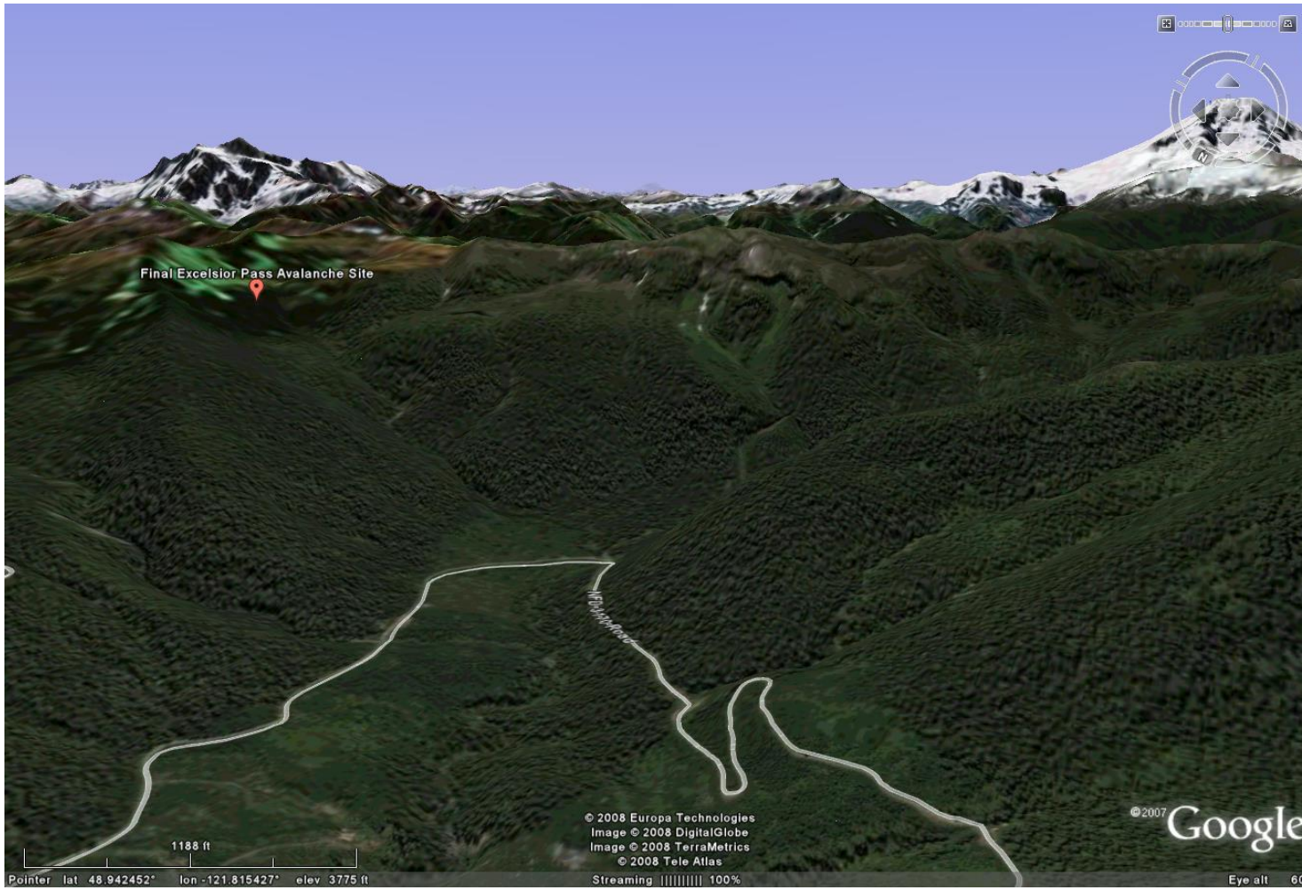
Figure 2. View of avalanche area toward the southeast, with Mt. Shuksan (L) and Mt Baker (R) in the background.