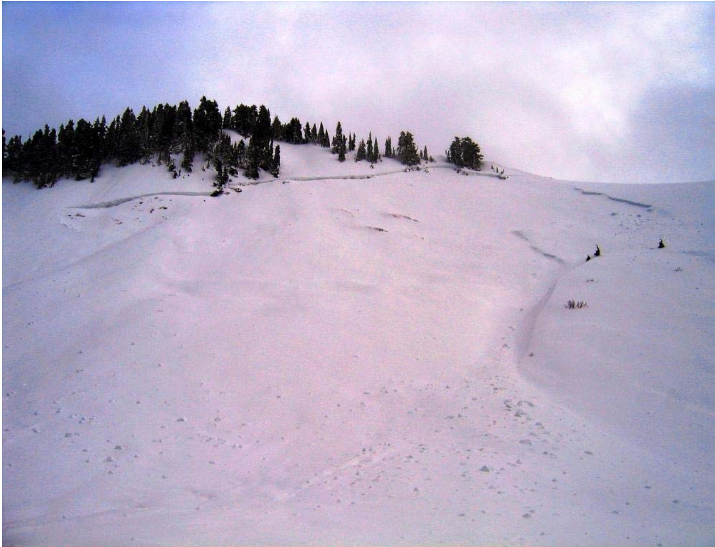
Figure 3. View upslope from some of deposition zone looking toward the east.